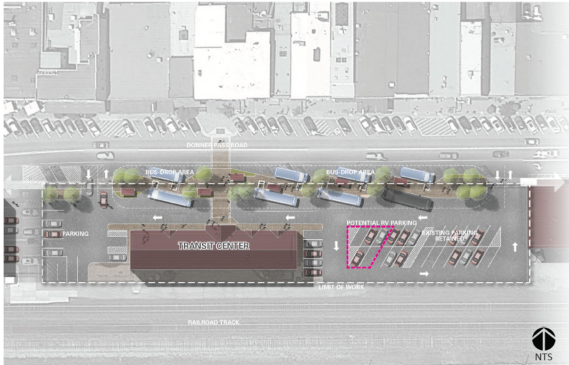
Existing Transit Center

Town staff and the consultant team presented the information on the final three sites at the February 2020 community workshop, the March 2020 Truckee Downtown Merchants Association meeting, and the final PAC meeting held in May 2020. Participants “voted” on the three sites at each of the meetings. Information packets on the three sites were also available on the project website for voting. The community outreach efforts and voting opportunities resulted in the Railyard North Balloon Track as the preferred site location as shown below.