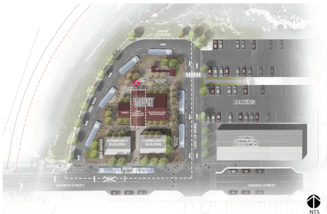
Railyard North Balloon Track