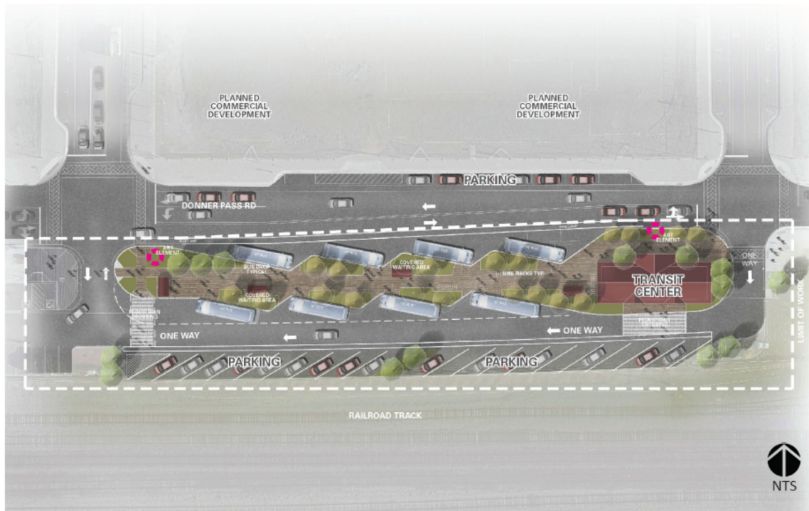
Railyard Parking Area East of Beacon Gas Station

With the final three sites determined by the PAC, the consultant team prepared detailed conceptual site designs for each of the three sites as shown below.